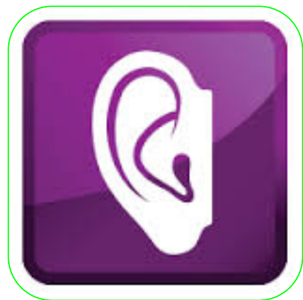
Leak Detection by Hearing