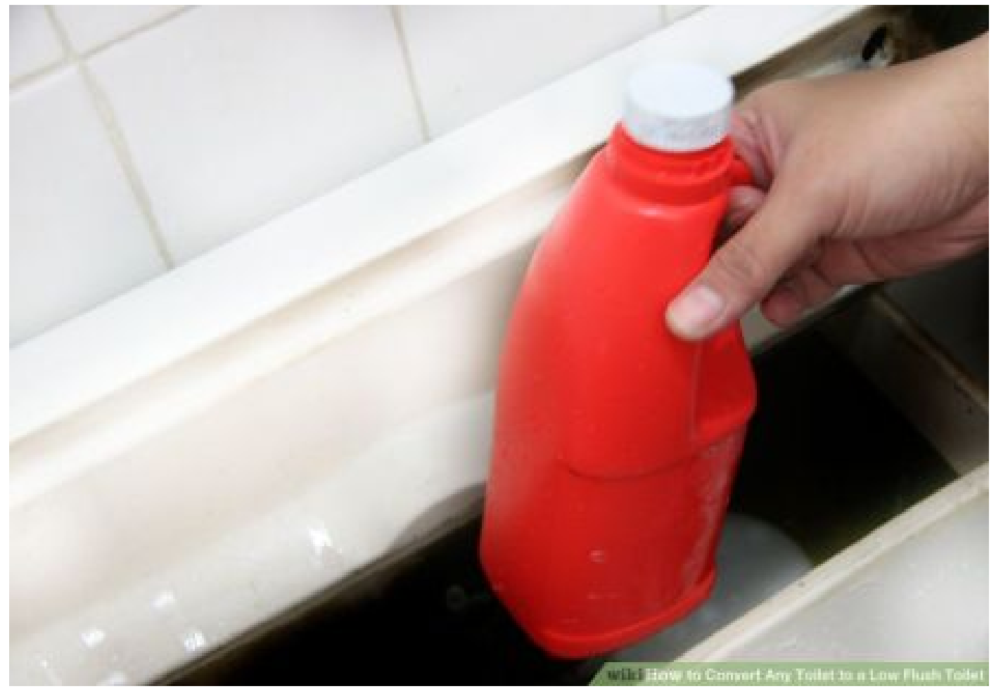
An alternative to reduce the flush water is to drop a brick/filled bottle in the flush tank, which will reduce the total quantity of water in the tank. More information :Here